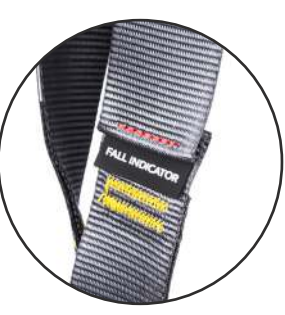
Rip stitch indicators