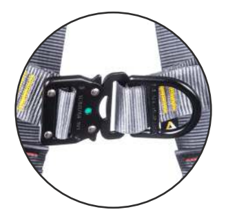
Front attachment point